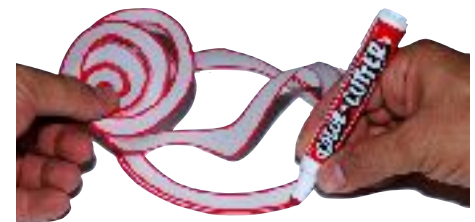
Junk Draw to Million $ Product