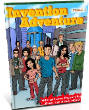
Perry's Invention Adventure Book